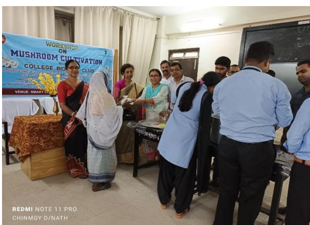
Spawns distribution among the villagers