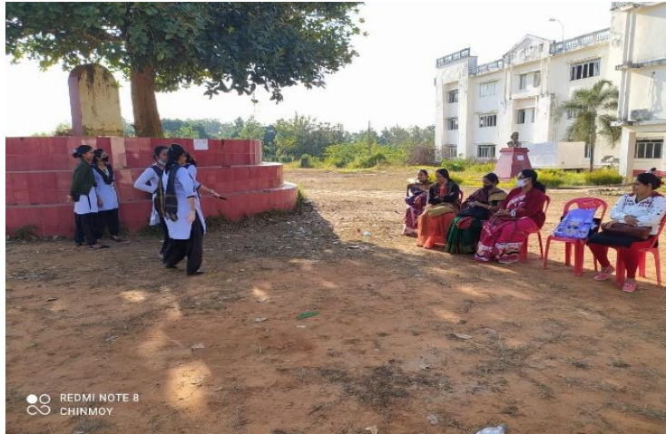
A moment of Rabindra Charcha Class in the open place 'Kathal Bithi'