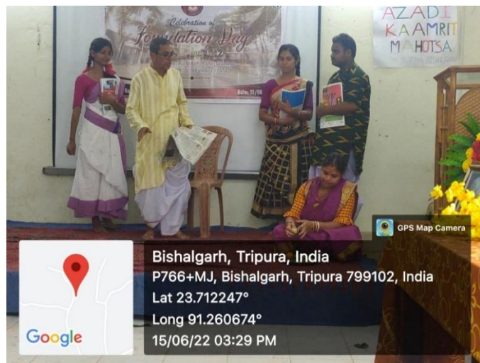
A moment of the Drama “Chuti” written by Rabindranath Thakur played by students and faculties of RTM, Bishalgarh