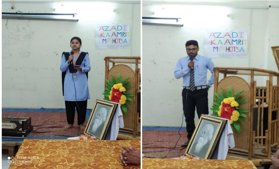
Recitation of Kabiguru's poems