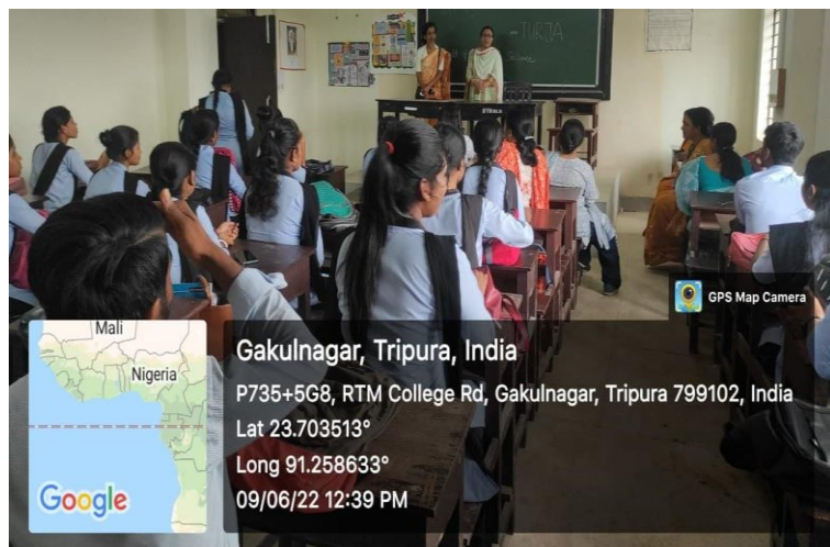
A moment of Rabindra Charcha Class in the Classroom