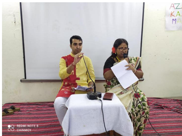
A moment of the Shruti Natak “Rakto Karabi” of Rabindranath Thakur played by faculties of RTM, Bishalgarh