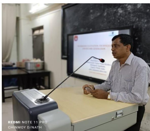
Organizing Secretary delivering Welcome Address