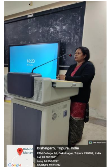
Organizing Secretary delivering Welcome Address