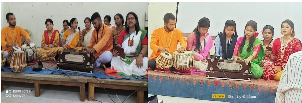
Kabiguru's dance and songs are performing by students and faculties