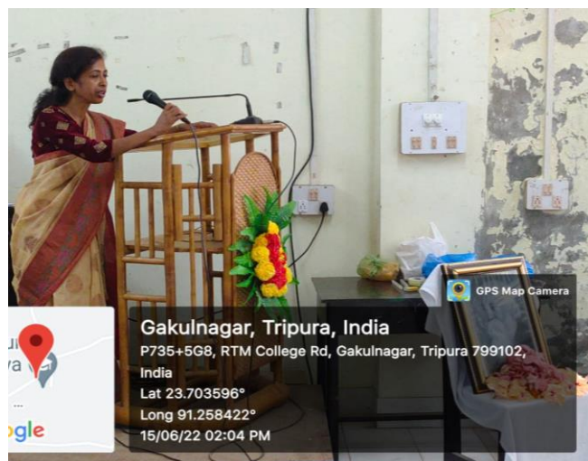
Speech is giving by Principal-in-Charge in the program of 161th Birth Anniversary of Kabi Guru Rabindranath Tagore