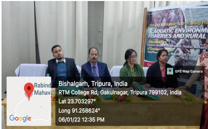
Dignitaries in the stage