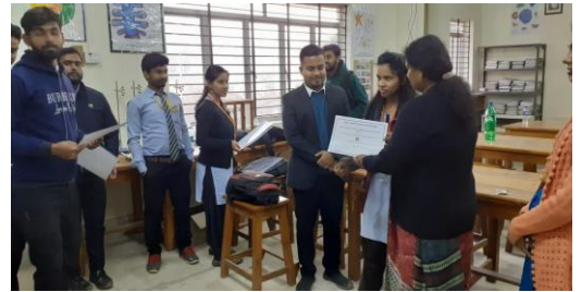
Distribution of certificate among participants