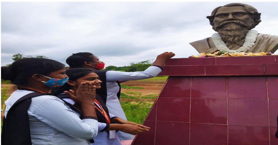
Students are offering Flowers to the Nobel Laureate Rabindranath Tagore