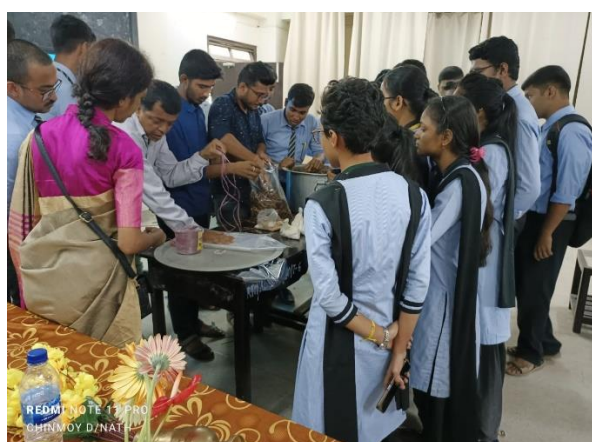
Moments of workshop