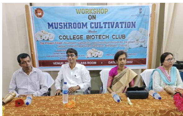
Dignitaries in the stage