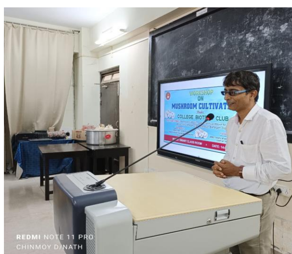
Resource Person delivering his Lecture