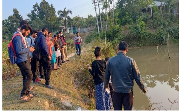
Moments of Hands on Training